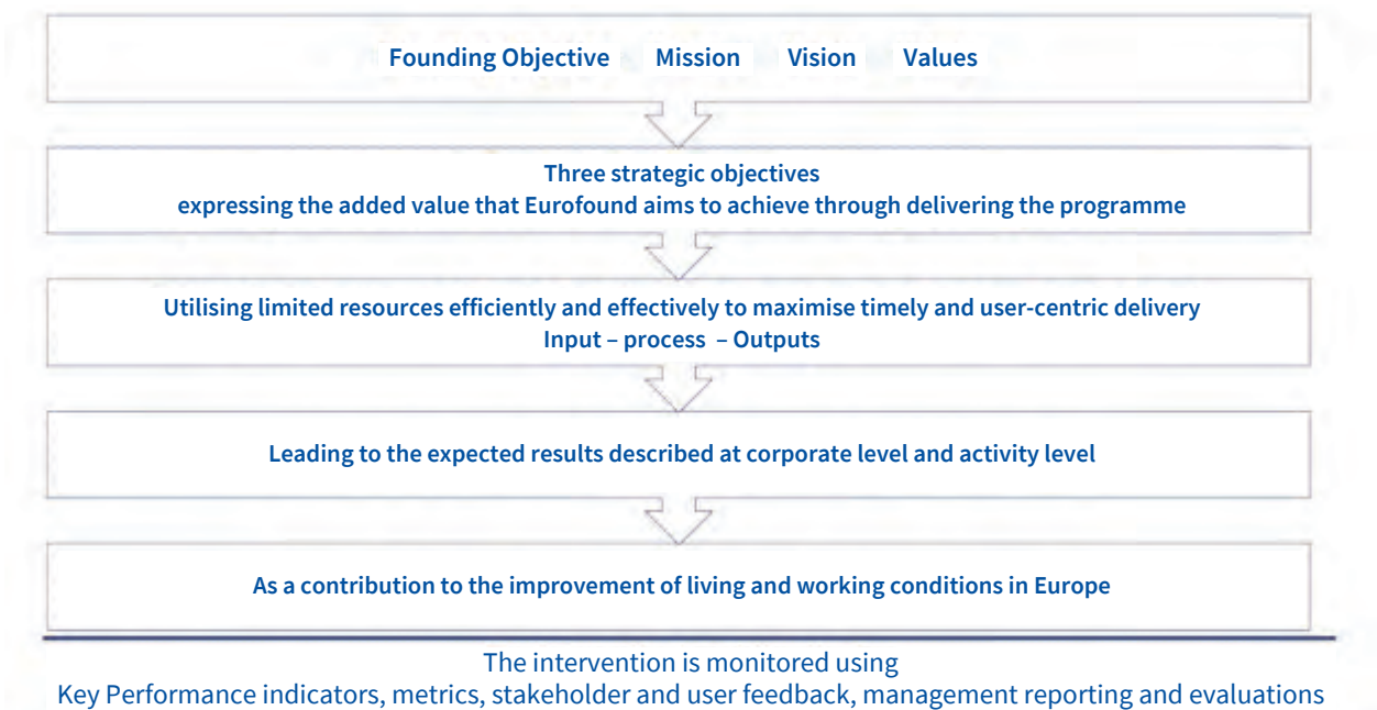
Figure 2: 2025–2028 programme intervention logic

Eurofound applies an internal control framework based on the model from the European Commission. It is designed to provide reasonable assurance in the achievement of five objectives of sound financial management as per Article 30, Section 2 of Eurofound’s financial regulation: (1) effectiveness, efficiency and economy of operations; (2) reliability of reporting; (3) safeguarding of assets and information; (4) prevention,